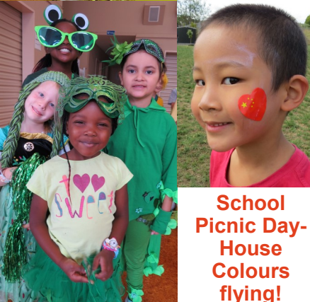
School Picnic Day- House Colours flying!