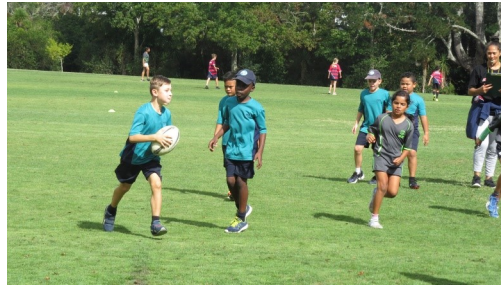
Auckland Christian Schools Touch Rugby Tournament, Moire Park, 11th March