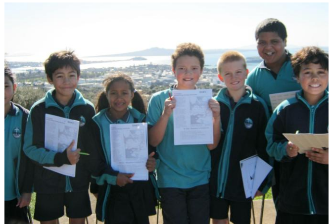
On the top of Mt Eden